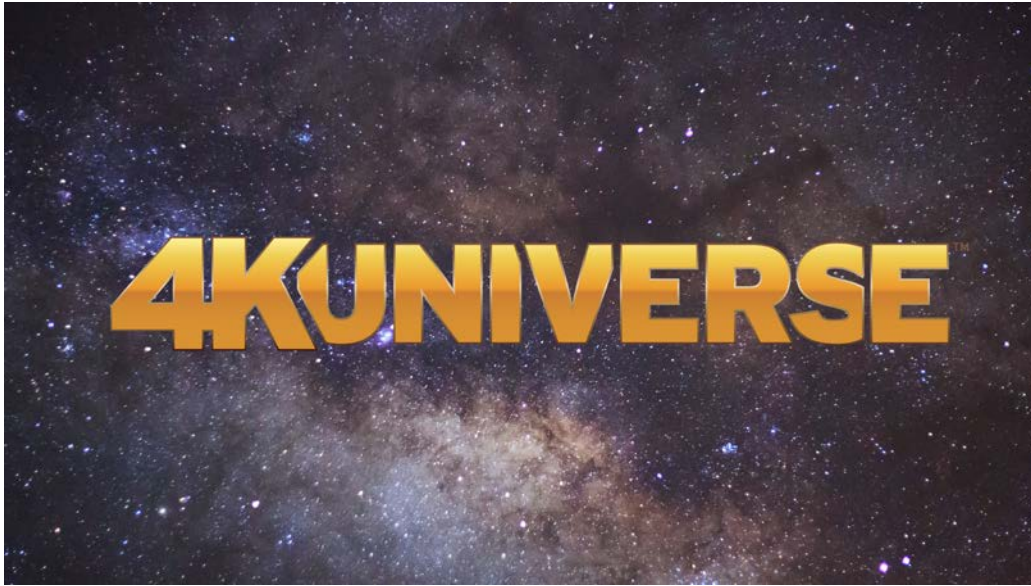
The new 4K HDR TV channel '4KUniverse'

4KUniverse's wide-ranging UHD programming delivered by AsiaSat 9 for Asian audience includes the children's series 'Eddie is a Yeti', new docufilm 'The Empire of Winds' and 'Model Turned Superstar' entertainment series.