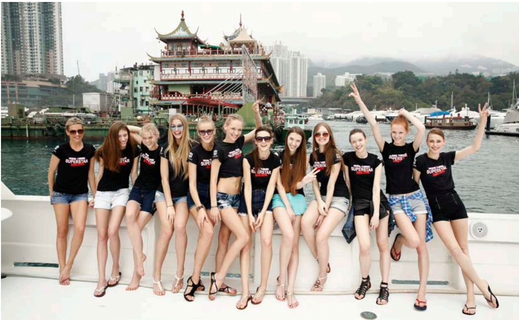
'Model Turned Superstar'