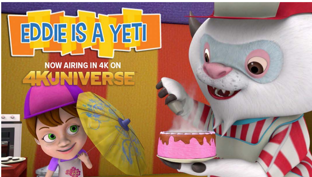
'Eddie is a Yeti'