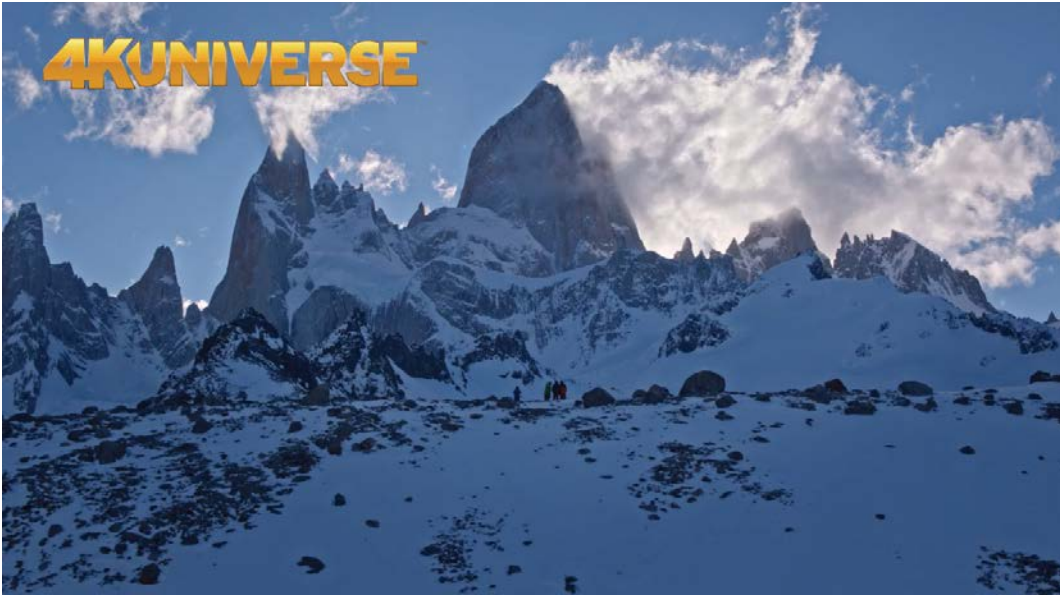
'The Empire of Winds'